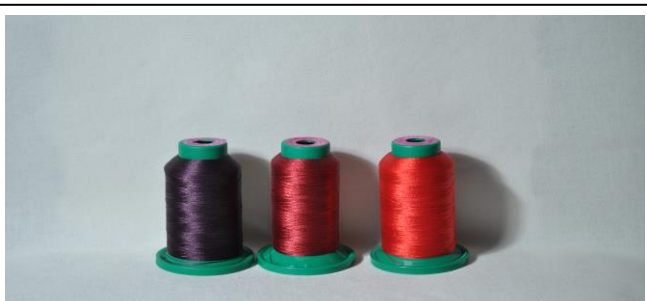
Isacord colors from L to R: 2994; 2113; 1902