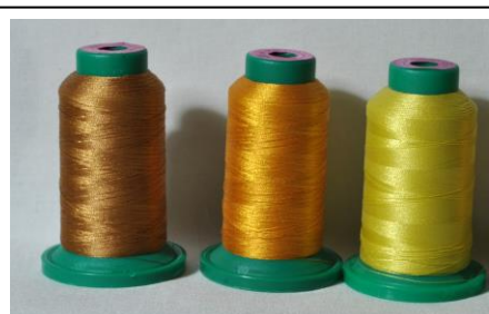
Isacord colors from L to R: 941; 824; 232