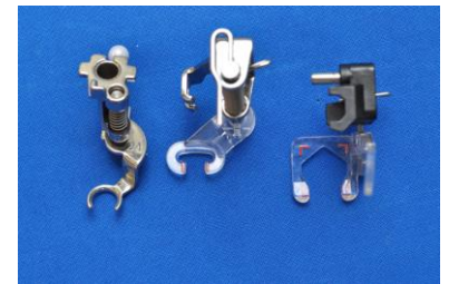
Appropriate free motion feet

To view my free video demonstrating the difference between a straight and zigzag stitch go to www.nancyprince.com and at the Home page, scroll down to Thread Painted Stitches